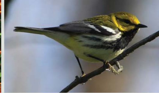
Black-throated Green Warbler