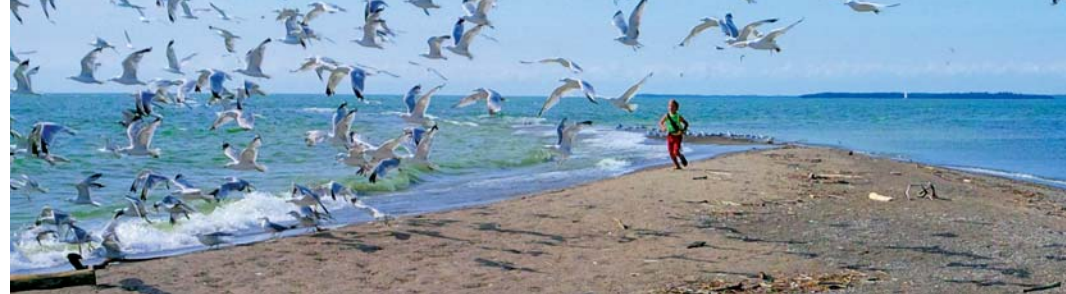
Middle Island in the distance, seen from the tip of Fish Point