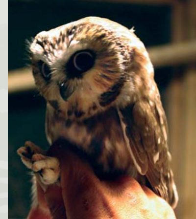
Northern Saw-whet Owl

Join neighbours and visitors, learn about migrating owls and see the ones caught for banding. Check for details later in the season, October 20th only if cool weather : www.pibo.ca ( rain dates Sunday )