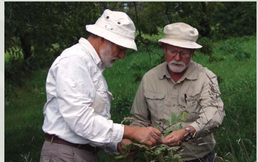
Biologists conducting native plant inventories on Pelee Island

By Land or By Water... While on Pelee, why not take in a tour and explore every little nook and cranny with one of the many knowledgeable island guides, including: EXPLORE PELEE (see their ad on p.13 for June discounts) and PELEE ISLAND CHARTERS