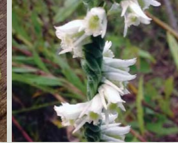
Southern Ladies' Tresses Orchid

Thursday-Wednesday, May 10-16 Writing Nature Workshop, Session 1