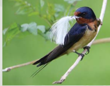
Barn Swallow

Weather permitting, small groups of visitors are welcome 7:00am-11:00am at the Fish Point station. For more details see: www.pibo.ca