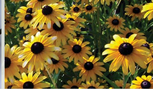
Orange Coneflower