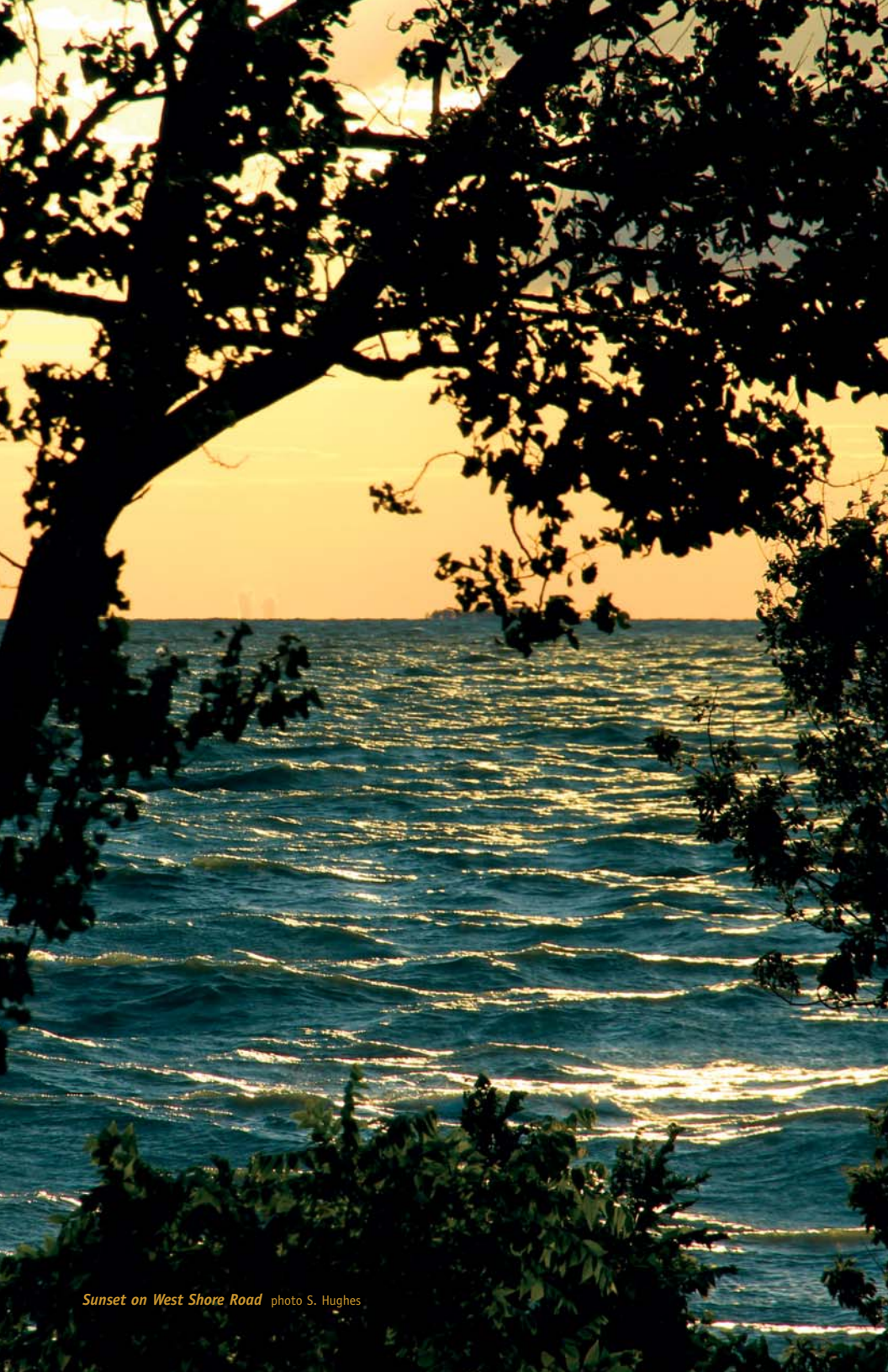
Sunset on West Shore Road