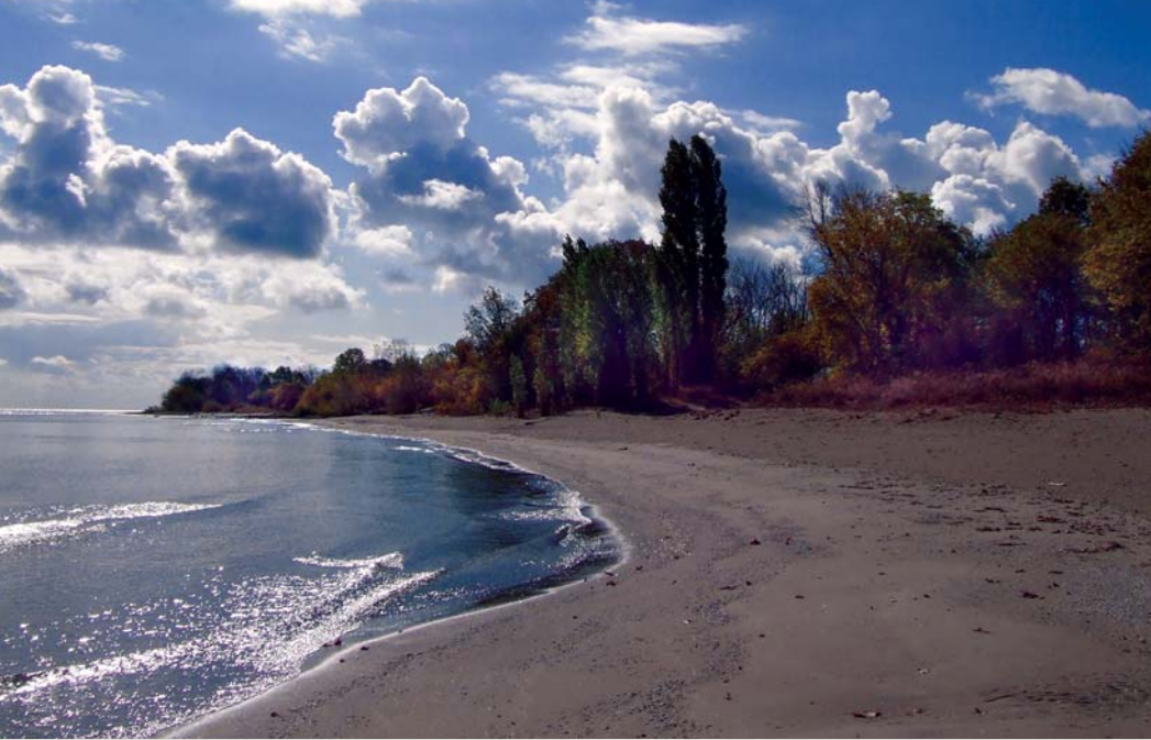
East Beach in Fall