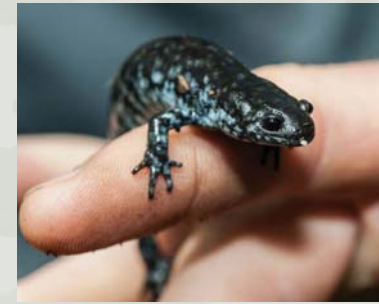
Pelee Salamander