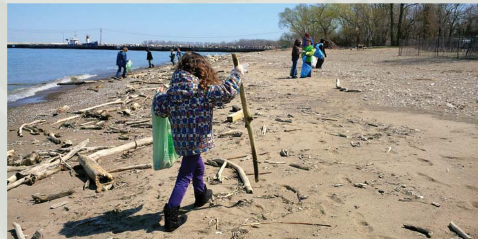
Great Canadian Shoreline Cleanup