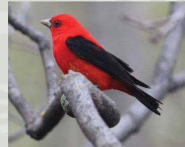
Scarlet Tanager

Weather permitting, small groups of visitors are welcome 7:00am-11:00am at the Fish Point station, access from a narrow trail at the road (watch for a parked car nearby) For more details see: www.pibo.ca