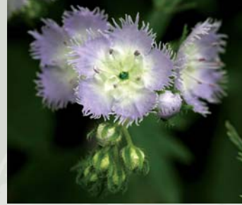
Miami Mist