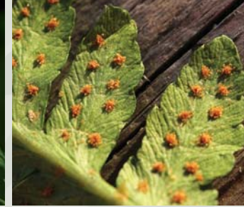
Clinton's Wood-fern