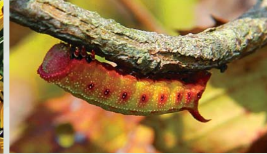
Hummingbird Clearwing Moth Caterpillar