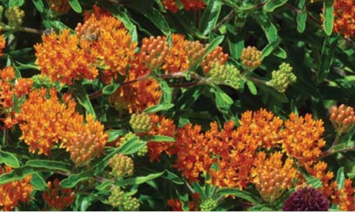
Butterfly Milkweed