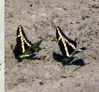
Giant Swallowtail butterflies