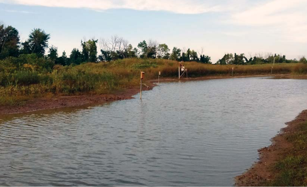
Kraus Wetland & Meadow Habitat Complex